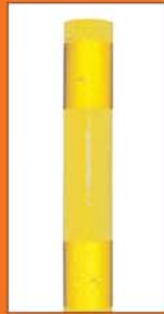
TYPE 5 MARKER POST Round post with recessed cap, two 3" (76.2mm) reflective wraps and Driveable Soil Anchor