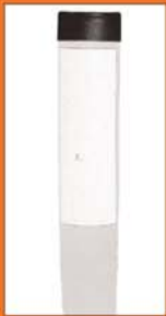
TYPE 2 GUIDE POST Round post, flattened on top with black oval cap, one 3"(76.2mm) x 9"(228.6mm) reflective strip and Driveable Soil Anchor