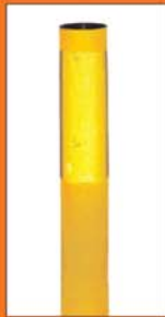
TYPE 3 CHANNELIZER Round post with recessed cap, one 6" (152.4mm) reflective wrap and Driveable Soil Anchor