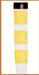
TYPE 1 HAZARD MARKER Round post, flattened on top with black oval cap, three 3"(76.2m) x 3"(76.2m) reflective patches and Driveable Soil Anchor.